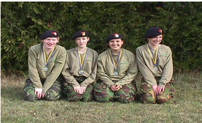
Wiltshire Army Cadets Winning Team